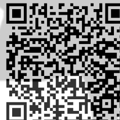
FEMA 5 Tips for Protecting Livestock During a Disaster