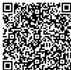
AVMA Small Farm Preparedness