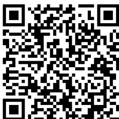
KDA Emergency Management

Scan the QR codes for additional information: