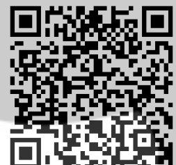
USDA Disaster Resource Center